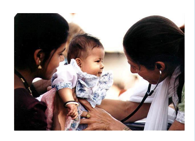
Goal 5: Improve maternal health

Complementing PRASAD's nutrition and health care programs are events like the Well-Baby Competition where doctors screen babies and toddlers for general wellbeing as well as physical, mental and social development. They also counsel parents on best practices in child-care. Babies born to mothers in our Reproductive and Child Health (RCH) Program had consistently higher birth weights than India's national average.