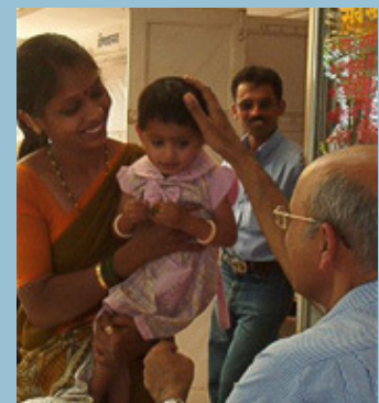
Progress in Health Care