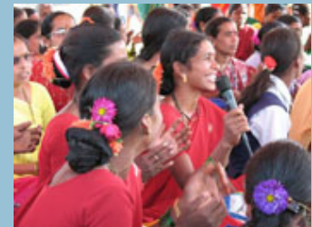
Empowerment through India's Self Help Group

By December of 2008, more than 1,000 HIV-positive individuals had registered with PRASAD'S HIV/AIDS program. The program also qualified for a grant from the Clinton Foundation enabling us to expand our treatment and social services for Tansa Valley children affected by HIV/AIDS.