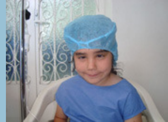
The gift of sight in Mexico